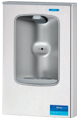
Touch-free non-refrigerated model