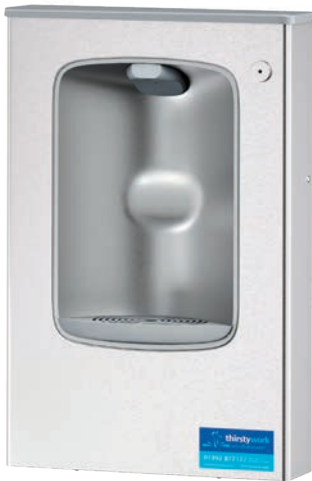
Manual non-refrigerated model

Our most compact non-refrigerated bottle filler